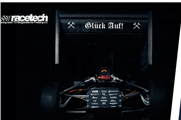
Lithium polymer battery (LiPo)