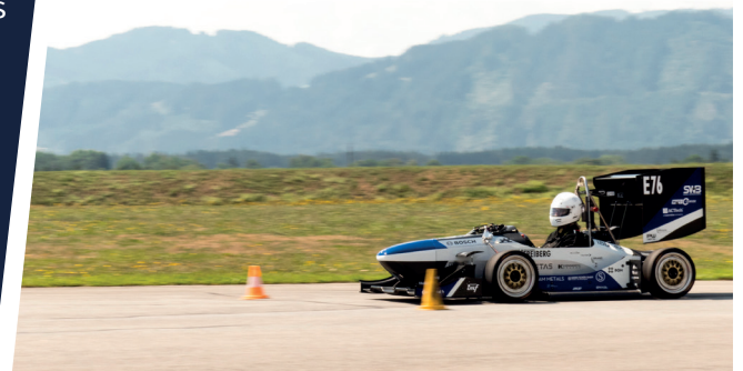
RT 13 in Event FSG (above) und FSA (below)